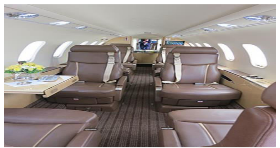
Fig.1: Seating arrangement of Lear Jet-45 with 9 seating capacity